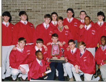
1997 Westbrook Football Team