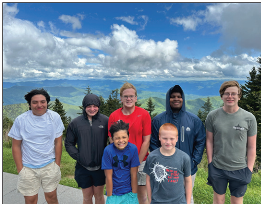
The Bryant Home had a great and windy vacation!